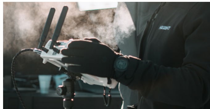
Martlet MI-2 Datasheet v7