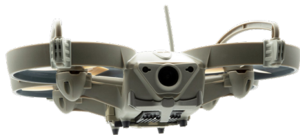
1x Loki MkII Tactical sUAV