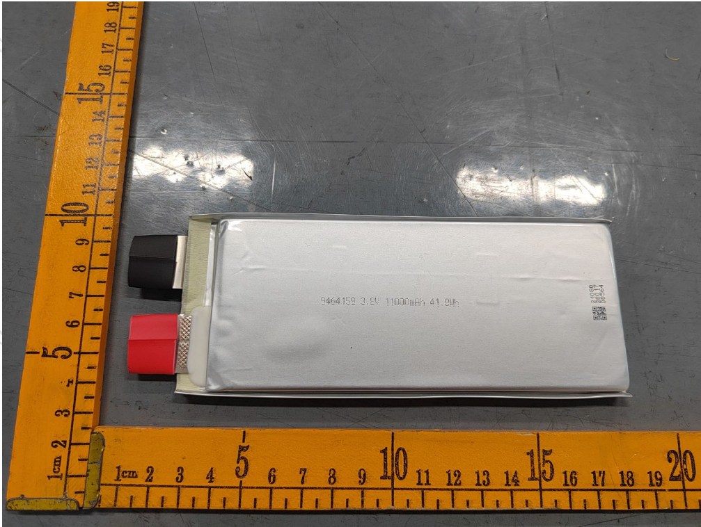
Figure 3 Overall View of cell (电芯外观图)