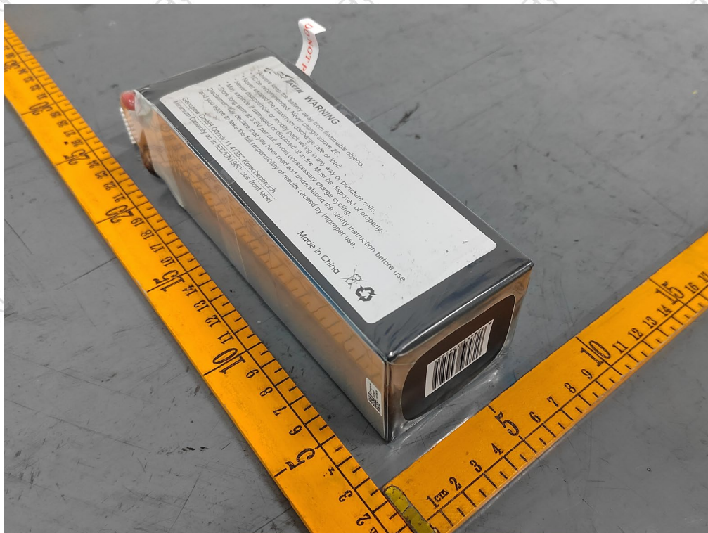
Figure 2 Overall view II of battery (电池外观图2)