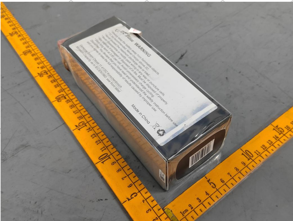
Figure 2 Overall view II of battery (电池外观图2)