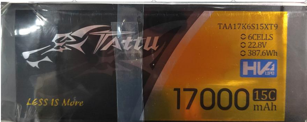
Figure 4 Battery Label (电池标签)