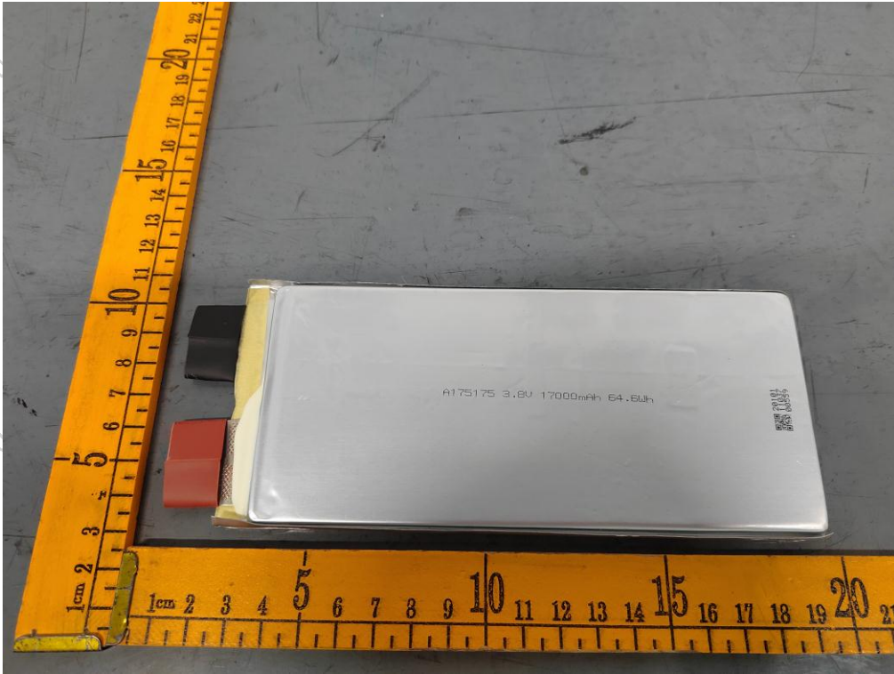
Figure 3 Overall View of cell (电芯外观图)